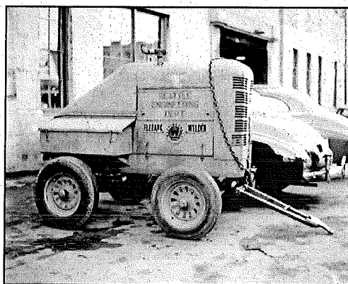
Portable Welder, 1948 Item 48762

A large number of maintenance equipment photographs are now available online. Prints are also available for browsing in photograph albums in the Archives. The photographs date from the late 1940s and early 1950s and includes rollers, trucks, pumps and air compressors.