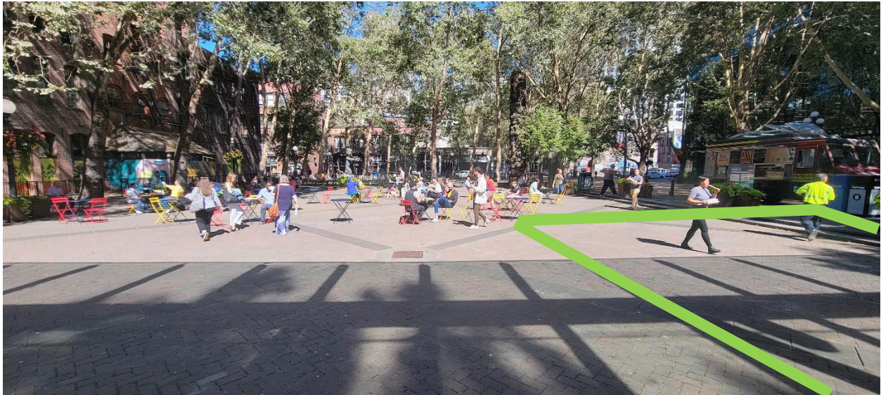
Photo of Proposed Area Location

Footprint for proposed beer garden installation includes a 20 ft x 40 ft fenced off bar with tables and chairs.