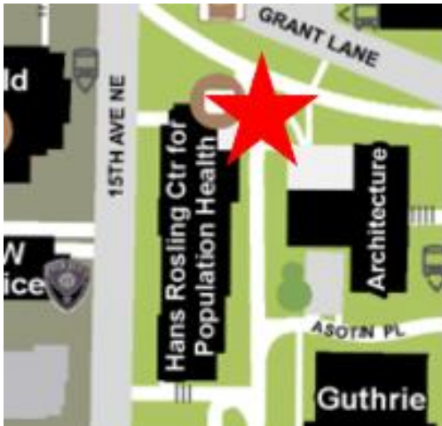
Location of The Seated IV