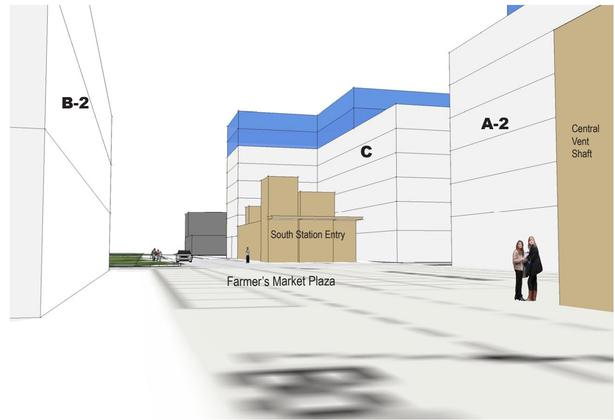
Looking south from the interior of the Nagle Place extension onto the Farmer's Market Plaza area.