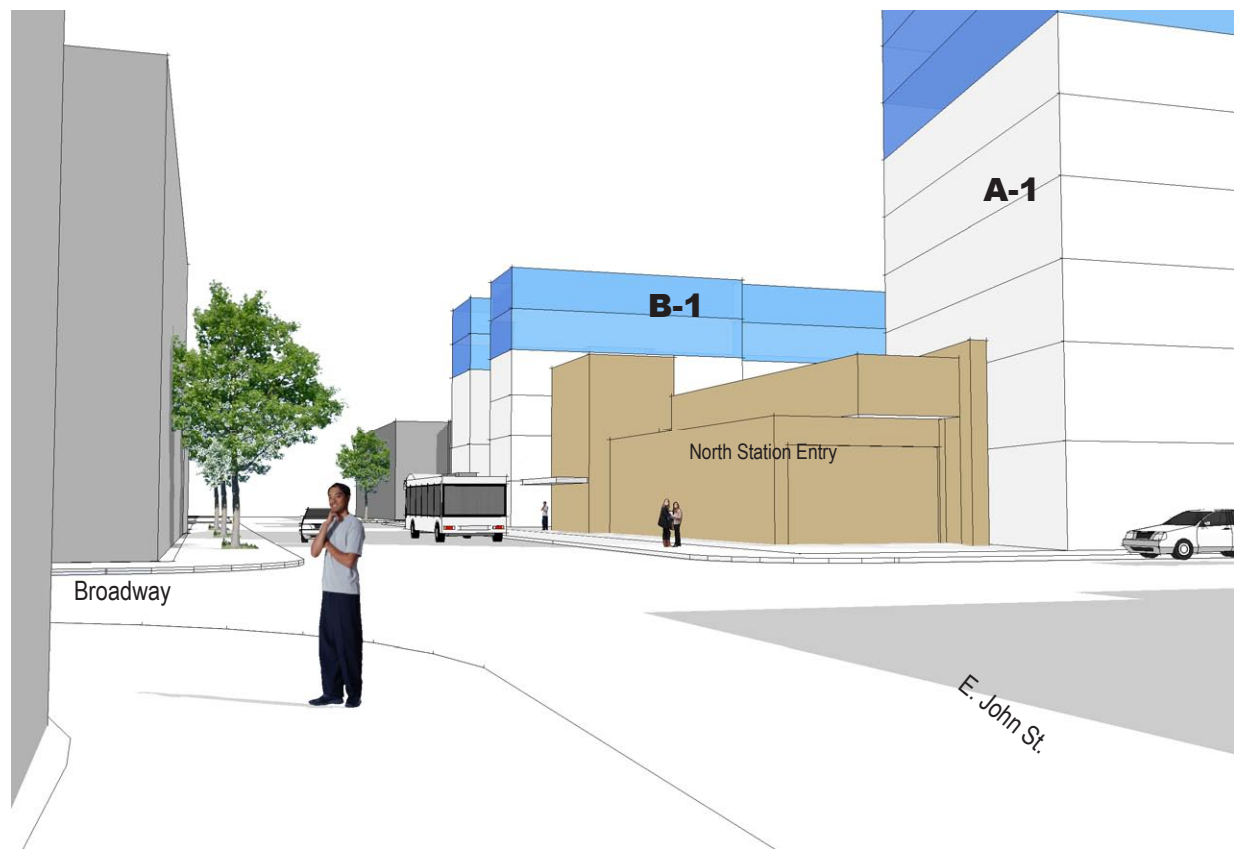
Looking southeast from the corner of E. John St. and Broadway to the north station entry and the corner of site A-1.