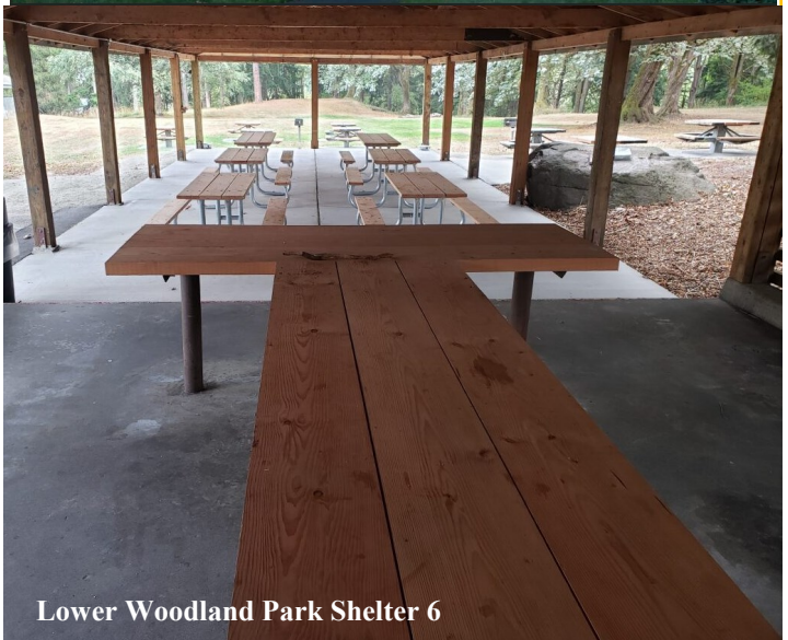
Lower Woodland Park Shelter 6