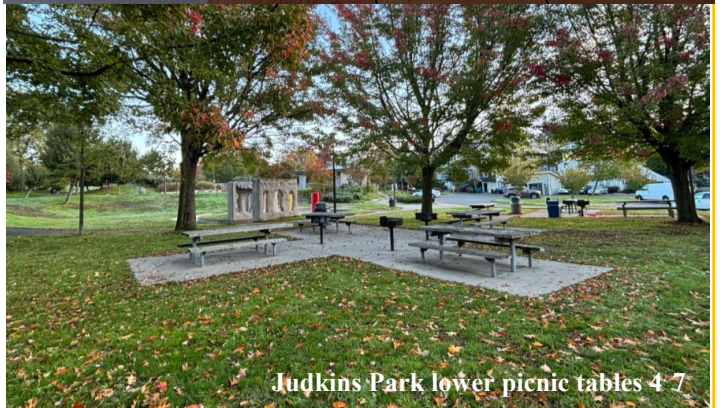
Judkins Park lower picnic tables 4 7