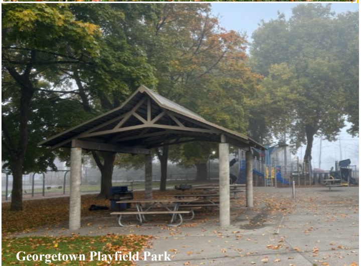
Georgetown Playfield Park