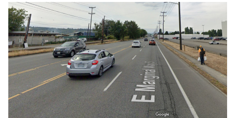
Existing: E Marginal Way S looking northbound