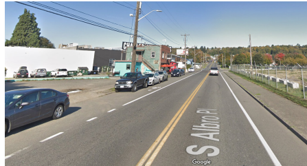
Existing: S Albro St looking northbound