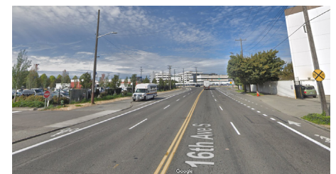
Existing: 16th Ave S (north of South Park Bridge) looking northbound