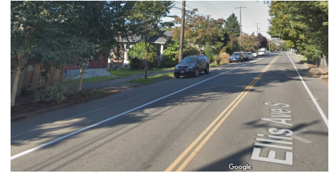
Existing: Ellis Ave S looking northbound