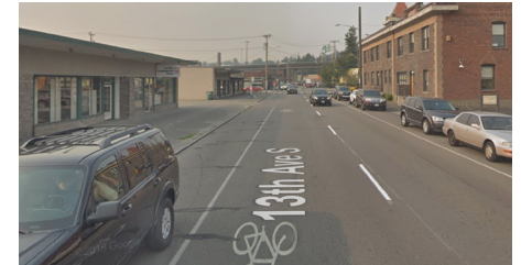
Existing: 13th Ave S looking northbound