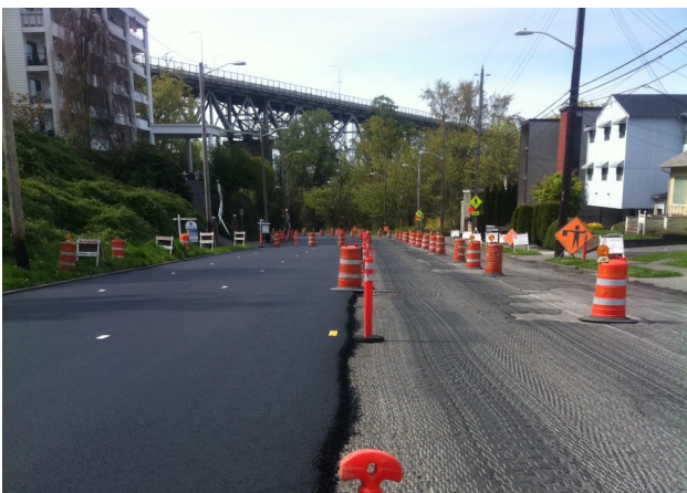
Example of paving work from Dexter Ave N paving project.