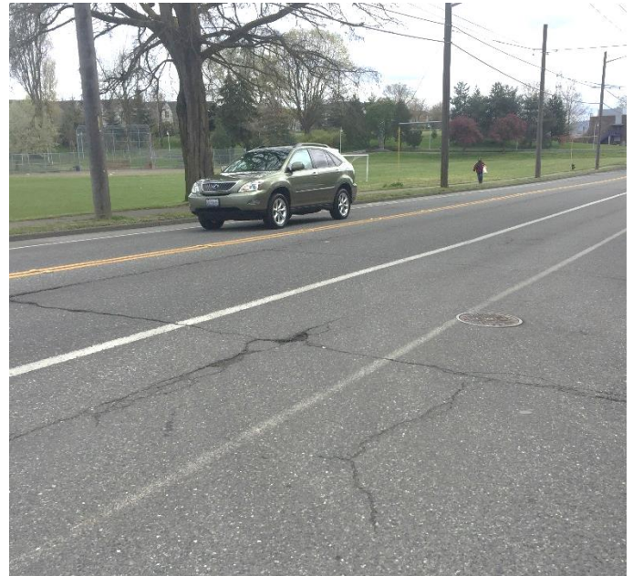
Swift Ave S / S Myrtle St / S Othello St needs to be repaved