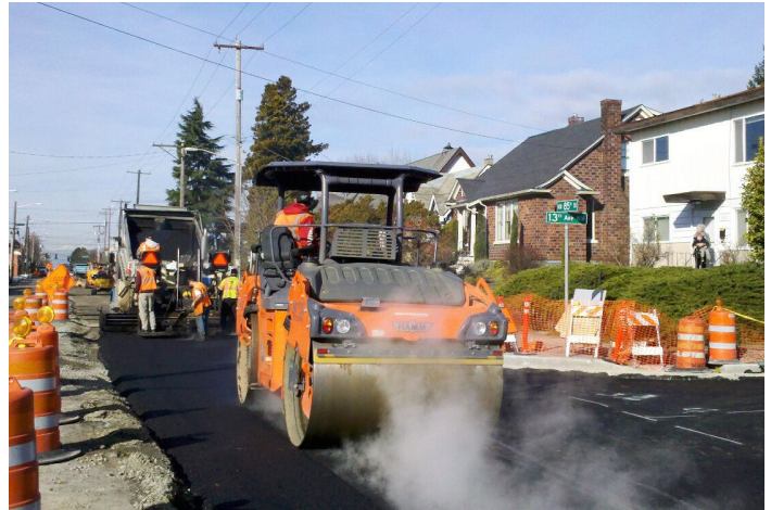
Example of crews completing a mill and overlay paving project

and major access impacts as work progresses along the corridor. Our goal is to work with the community to limit construction impacts to the extent feasible.