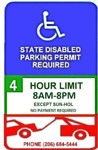
Example of existing SDOT designated disabled sign.

Time limits: For new installations of on-street designated disabled parking spaces, SDOT will use time limits consistent with the remainder of the existing parking on the block face. In areas with existing time limits or paid parking of 4-hours or less, SDOT will post a 4-hour time limit on the disabled space that is in effect the same hours as other time limits on the same block face.