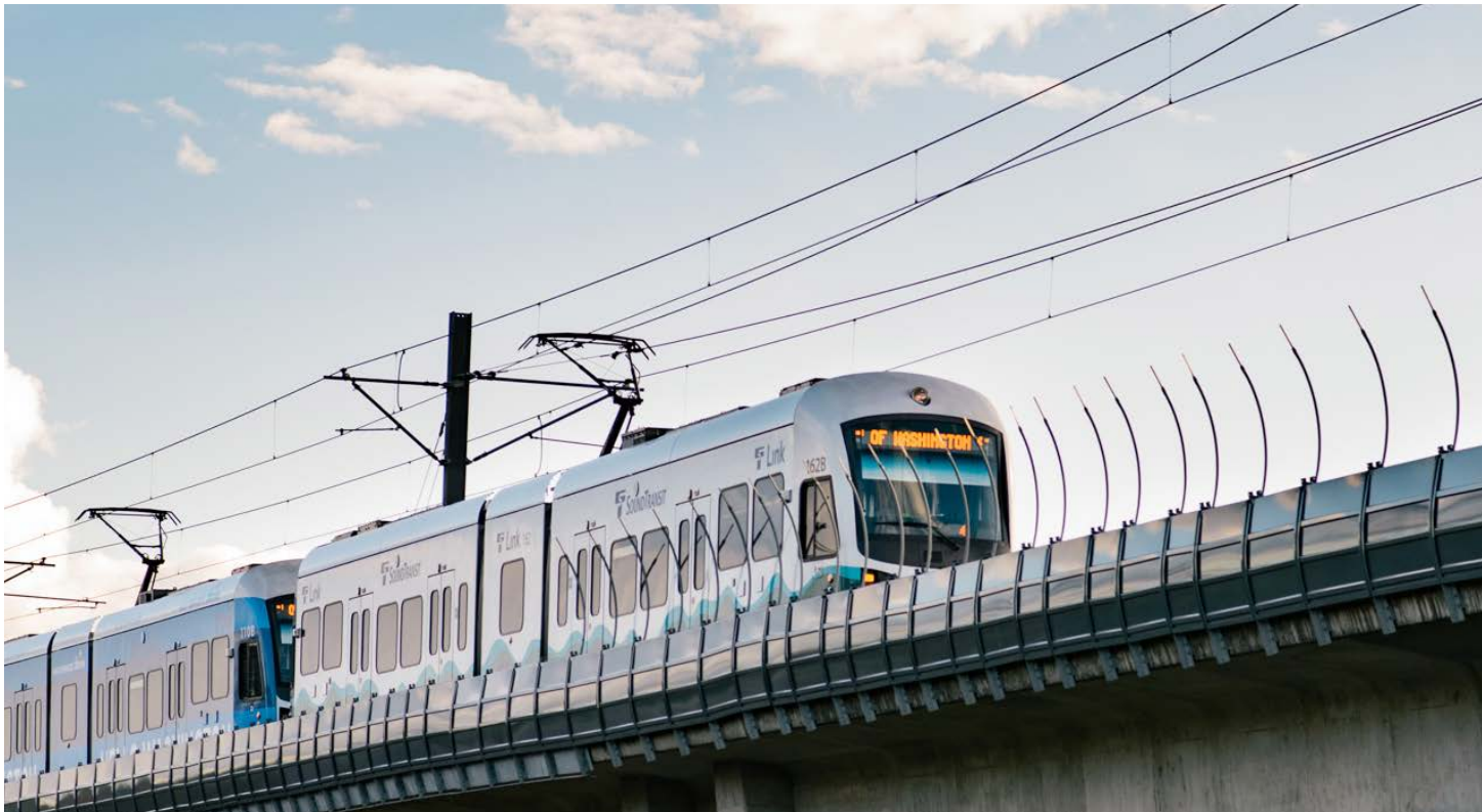
Light rail is coming soon to NE 130th & I-5

*Construction timelines can change. They depend on when workers and materials are ready.