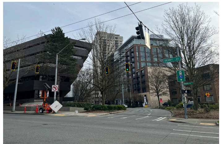
Current conditions of project area looking south towards 2nd Ave from Denny Way.