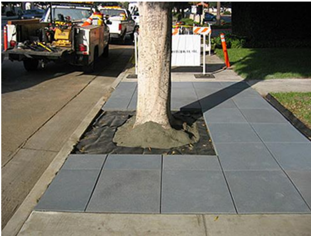
Rubber sidewalks can provide a flexible walking surface

The team used information about existing SDOT practices and conducted new research to learn about approaches to managing conflicts between trees and sidewalks. This work identified national and international best practices as well as emerging practices and promising areas of new research that could be used in Seattle. Our research spanned tree-related best practices (e.g., species, roots, nutrients, irrigation) as well as infrastructure and design best practices (e.g., street edge, design standards, materials, utilities). The best practices research is summarized in the plan on pages 13-20 and in Appendices A and B .