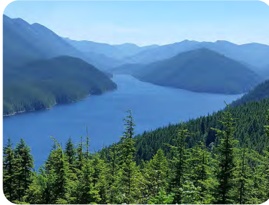
Sunrise view of Chester Morse Lake in the Cedar River Watershed.

Based on current conditions and forecasts, we anticipate that Seattle will continue to have sufficient water supply for people and fish throughout the summer, thanks to our ability to refill our mountain reservoirs and carefully manage the water system daily.