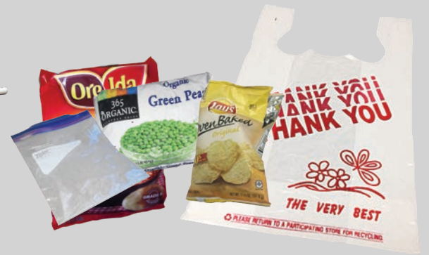
Ziploc®, food & single plastic bags