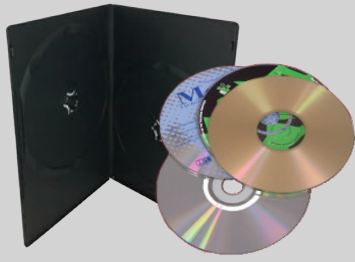
CDs, DVDs, and cases