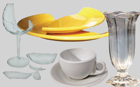
Ceramics & glassware (broken or unusable)