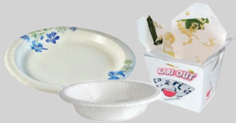
Food-soiled coated (shiny) paper plates, bowls and take-out containers