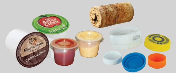
Small lids, caps, tops, & cup (less than 3 inches wide)