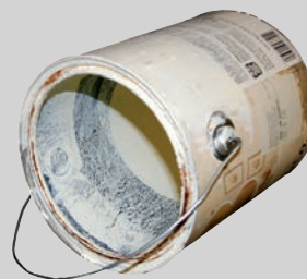
Paint cans (empty, dry & lid off)