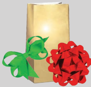
Ribbons, bows, and metallic gift wrap