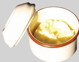
Cooma alwaadaa, zayitii fi giraasoo (qabiyyee kan hin yaaddeessine keessa)