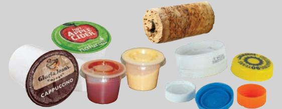
Qadaadawan xixiiqqo, qadaadawan, bantii fi siini (inchi 3 bal'aa jala ta'ee)