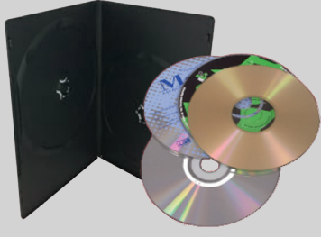
CDwaan, DVDwaan fi qola

Wantoota kaneen gari kossi keessa bussa.