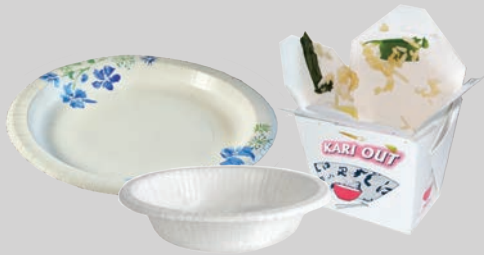
Sahaanii waraqaa fud-soyildi (calaqqisuu) uwwifamnee, shaanii golboo fi qabiyyee ala bassa