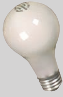
Ampollota florasantii hin tanee