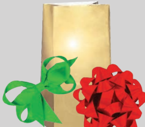
Sabbatota, guubee, fi haguugaa kenna sibiila