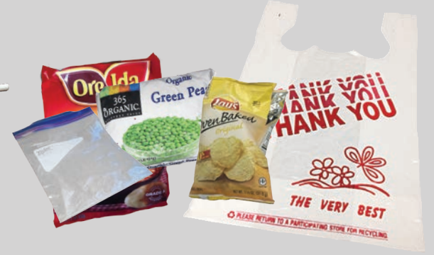
Ziploc®, nyaata fi subba plaastikaa leexaa