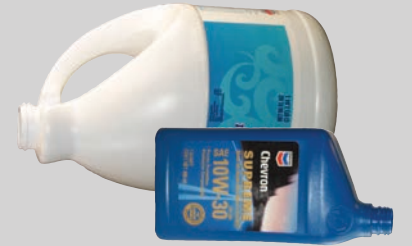
Summaa duwaa qabiyyaale meeshoota