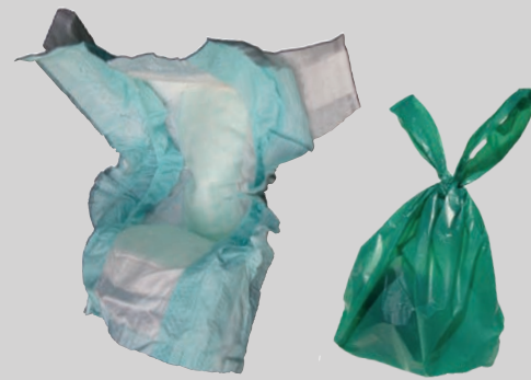
Daypaa fi balfaa neefkaa (subba keessa)