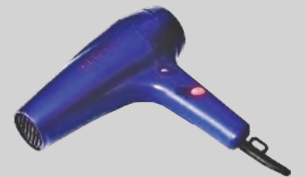
Wantoota xixiiqqotajaajila manaaf olaan