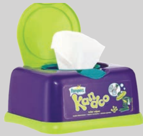
Bahaati qulqullina eegaata