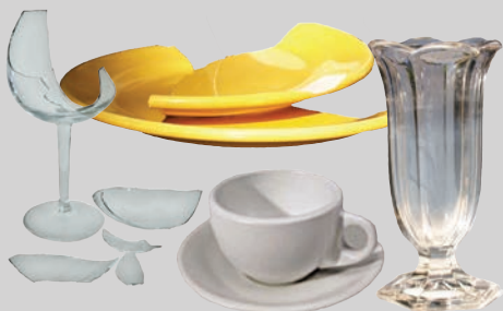
Seramikkoota, fi wantoota bircciqqoo (cabaaykn kan hin fayyadan)